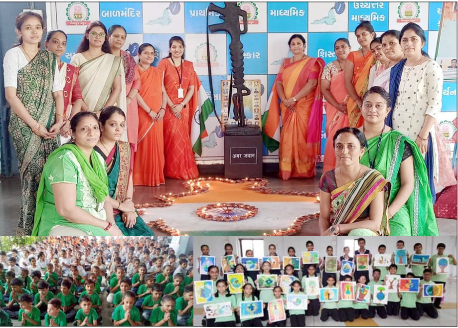
વિદ્યાકુંજ સ્કુલ પ્રાથમિક વિભાગમાં ‘મેરી મિટ્ટી મેરા દેશ’ કાર્યક્રમ યોજાયો હતો.